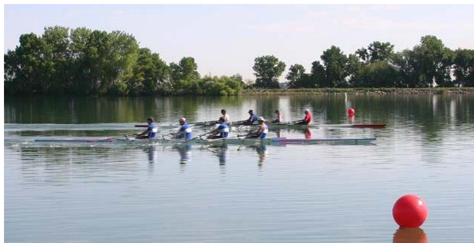
Men's 4x: photo finish for second and third.